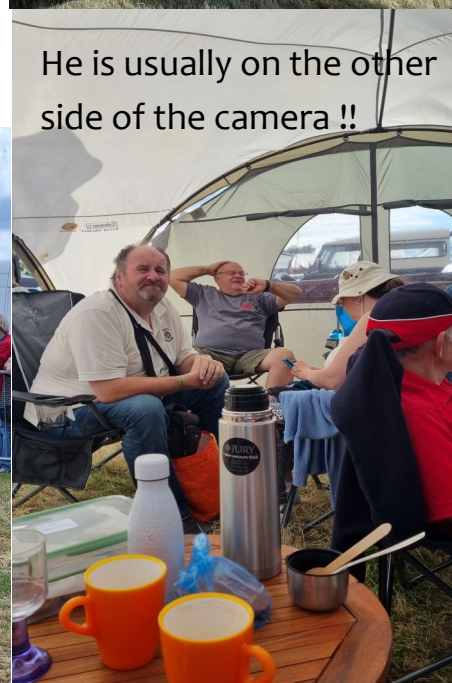
He is usually on the other side of the camera !!