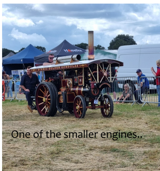
One of the smaller engines..