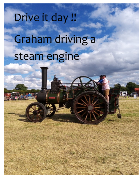
Drive it day !! Graham driving a steam engine