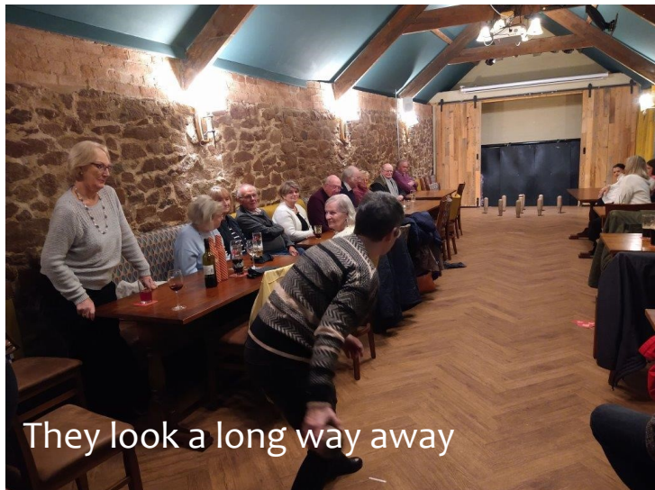
They look a long way away