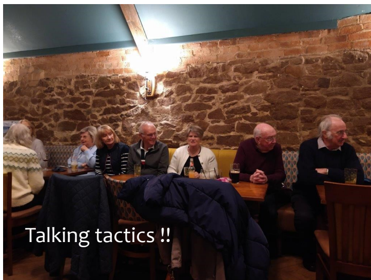
Talking tactics !!