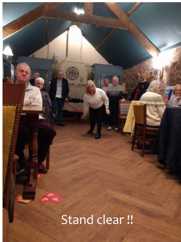
Stand clear !!