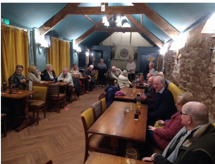
Training session, drinks first.

The winner and The Wood Yard Girls, they did work hard..