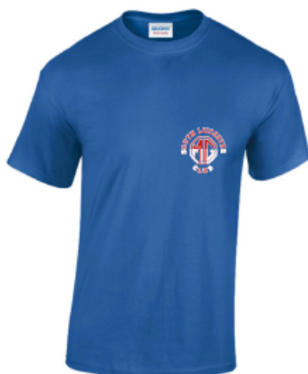
Everyday Heavy Cotton T-Shirt 180g