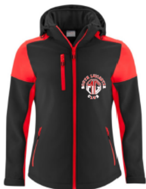
Printer Prime Ladies Softshell

Just call in, Shop and ask for the clubs logo to be added. Examples below.