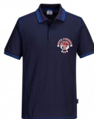
B218 Polycotton Two Tone Polo Shirt

£15 from the clubs treasurer. Stuart Armston.