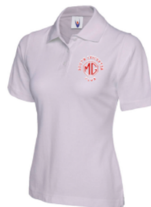
Ladies Classic Polo Shirt 220g