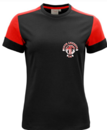
Printer Prime Ladies T-Shirt 180g