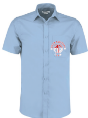
141 Kustom Kit Mens S/S Poplin Shirt