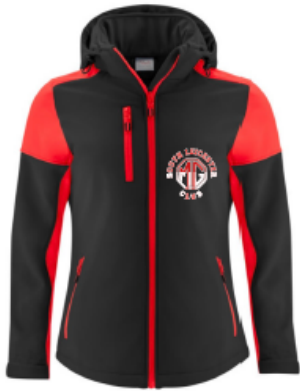
Printer Prime Ladies Softshell

Just call in, Shop and ask for the clubs logo to be added. Examples below.