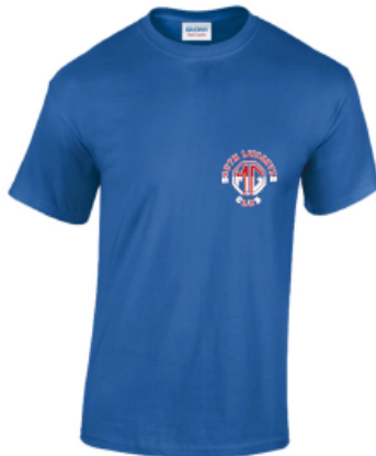
Everyday Heavy Cotton T-Shirt 180g