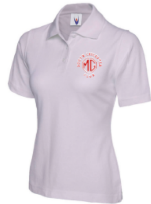
Ladies Classic Polo Shirt 220g